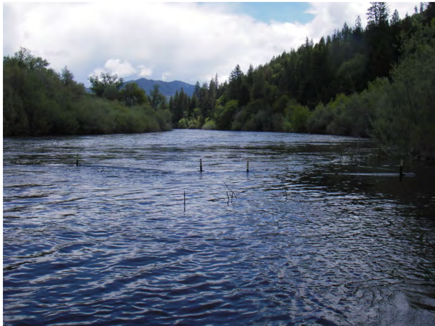
Figure 4. Upstream views of the pass-through antennas on July 27 (top photograph) and June 1, 2011 (bottom photograph), Klamath River, northern California. Average hourly discharges measured at USGS gaging station 11516530 downstream of Iron Gate Dam were 1,090 ft 3 /s on July 27 and 3,200 ft 3 /s on June 1, 2011.