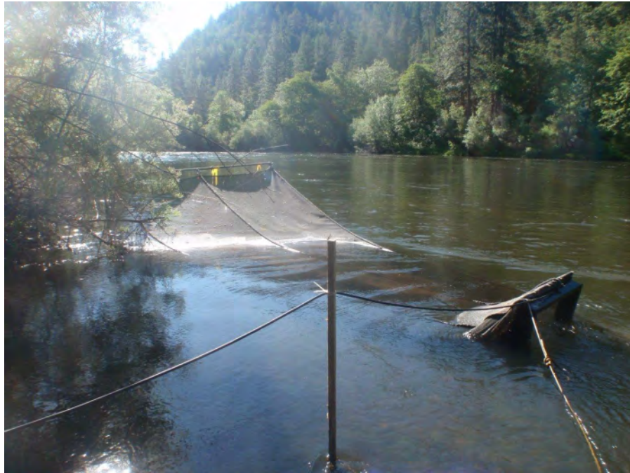
Figure 5. Upstream view of the PIT detection system mounted in the frame net at Klamath River kilometer 271.2, northern California.

A secondary PIT detection system deployed from a frame net was installed in a flat-water run habitat on the river right at Klamath River kilometer 271.2. A wide-mouthed net was anchored to a 23.1 × 1.5 m metal frame. The wide opening faced upstream and a 15-m net tapered down to a Biomark 0.6 × 0.6 m waterproof pass-through antenna at the downstream end (fig. 5). A Destron FS2001 transceiver on the right bank recorded tag detections and data were downloaded weekly. This PIT array was operated from June 2 to July 13, 2011, when decreasing water depth made the pass-through trap ineffective.