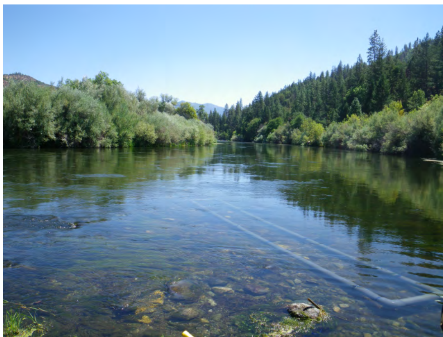
Figure 2. Upstream view of one of the pass-by antennas at Klamath River kilometer 252.7, northern California, August 25, 2010.

The primary PIT detection system was a Digital Angel FS1001M multiplexing transceiver and six full-duplex PIT tag antennas at Klamath River kilometer 252.7 from the river mouth. Six 6.1 \times 0.60 m PIT tag antennas were constructed and installed in a pass-by orientation (mounted horizontally to the river bottom; Connolly and others, 2008) in late August 2010 when Iron Gate Dam discharge was near the lowest of the year (fig. 2). These antennas spanned the width of the river when installed. Each antenna consisted of wires and electronics housed inside a 10.2-cm diameter polyvinyl chloride pipe and formed a rectangle. At the time of installation, river discharge near Iron Gate Dam was about 1,000 \text{ ft}^3/\text{s} and gage height was 0.74 m (USGS gaging station 11516530). Water depth at the PIT array site ranged between 0.6 and 1.25 m during installation. The antennas were attached to the river bottom in a 1 \times 6 array perpendicular to flow to span as much of the 42.6 m wide river channel as possible (six antennas laid end-to-end across the river). Antenna 1 was located nearest the transceiver on river left (facing downstream) and each subsequent antenna was installed extending out from the previous antenna towards the opposite bank. Each antenna was secured to the river bottom using about ten 10–20 cm earth anchors driven 1.5 m below the cobble substrate leaving a loop at the surface for attachment.