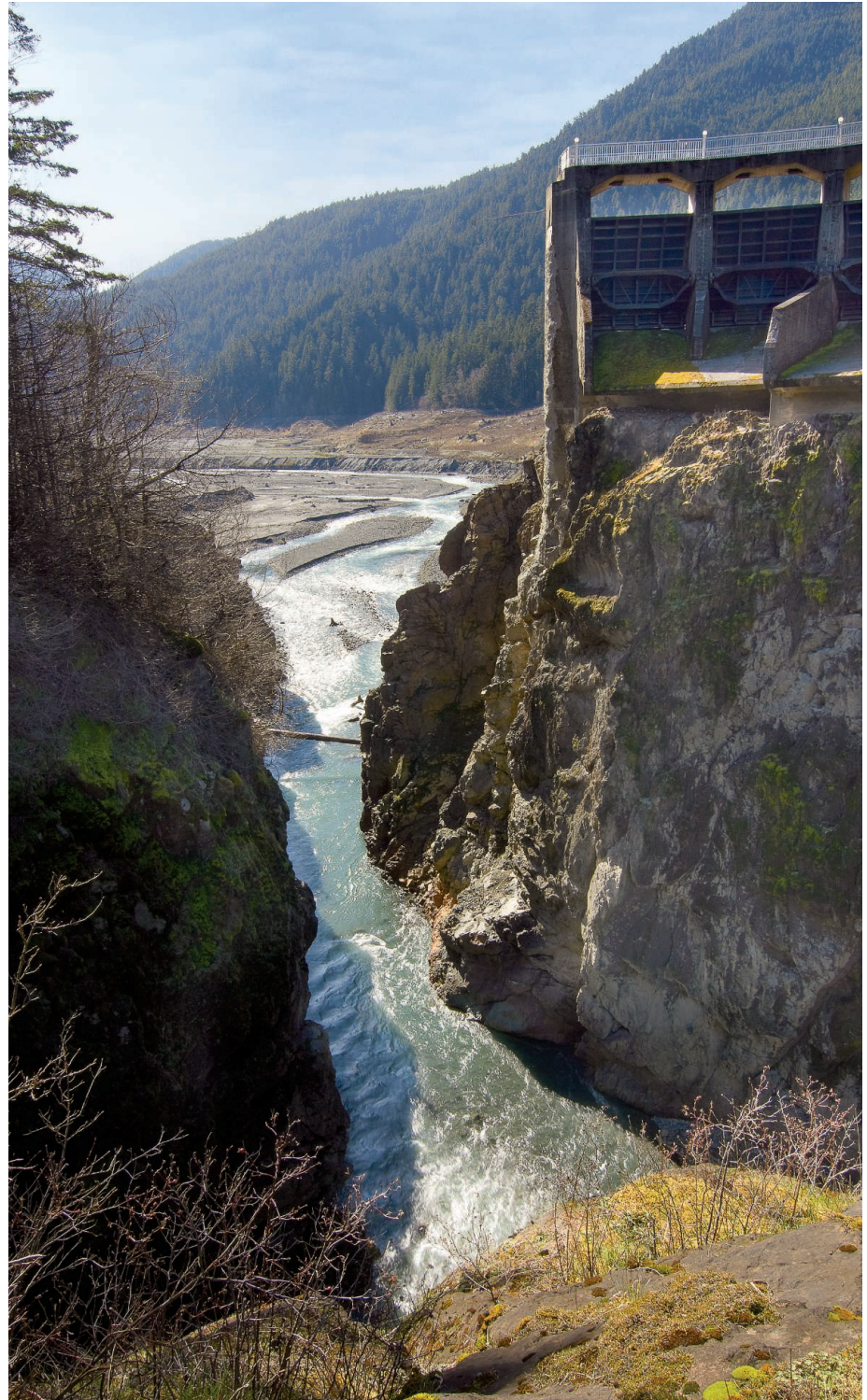
Goodbye to a large dam. Elwha River passing through the remains of Glines Canyon Dam on 21 February 2015. The former Lake Mills can be seen in the background.

A major finding is that rivers are resilient, with many responding quickly to dam removal. Most river channels stabilize within months or years, not decades (4), particularly when dams are removed rapidly; phased or incremental removals typically have longer response times. The rapid physical response is driven by the strong upstream/downstream coupling intrinsic to river systems. Reservoir erosion commonly begins at knickpoints, or short steep