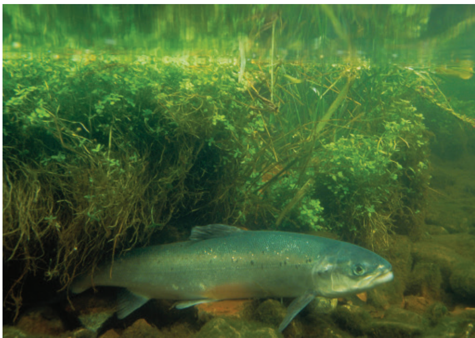
Atlantic Salmon, Photo Credit: U.S. Fish and Wildlife Service

This goal focuses NOAA Fisheries' protected species recovery and conservation efforts over the next five years on species on two opposite ends of the endangered species spectrum—species that need immediate efforts to prevent extinction as well as species with stable or growing populations that, with some concerted effort, may be candidates for removal from the Endangered and Threatened Species List. We call this the Species in the Spotlight initiative. We are undertaking a focused strategy to marshal the resources available within NOAA and engaging our existing and new partners and their expertise to target the most important recovery actions for these species.