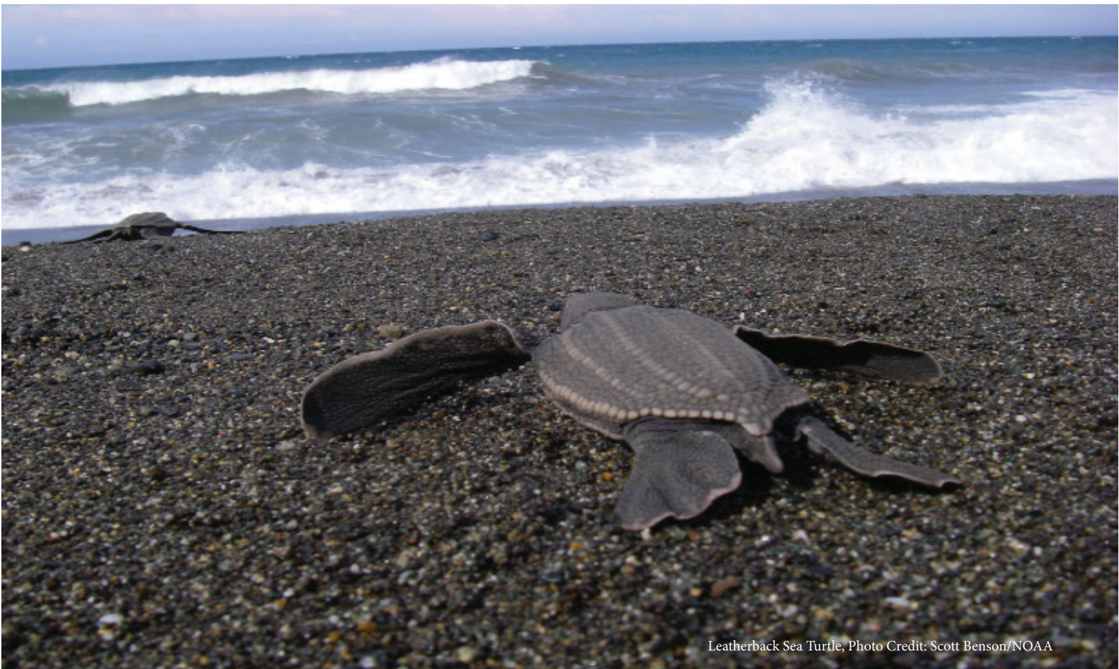
Leatherback Sea Turtle

These species are critical to the sustainability and health of our marine, estuarine, and riverine ecosystems and the resiliency of our coastal communities that depend on them. Our continued enjoyment of all the benefits provided by these valuable, but vulnerable, living resources and their habitats depends on our collective efforts to understand and conserve them under the ESA and the MMPA.