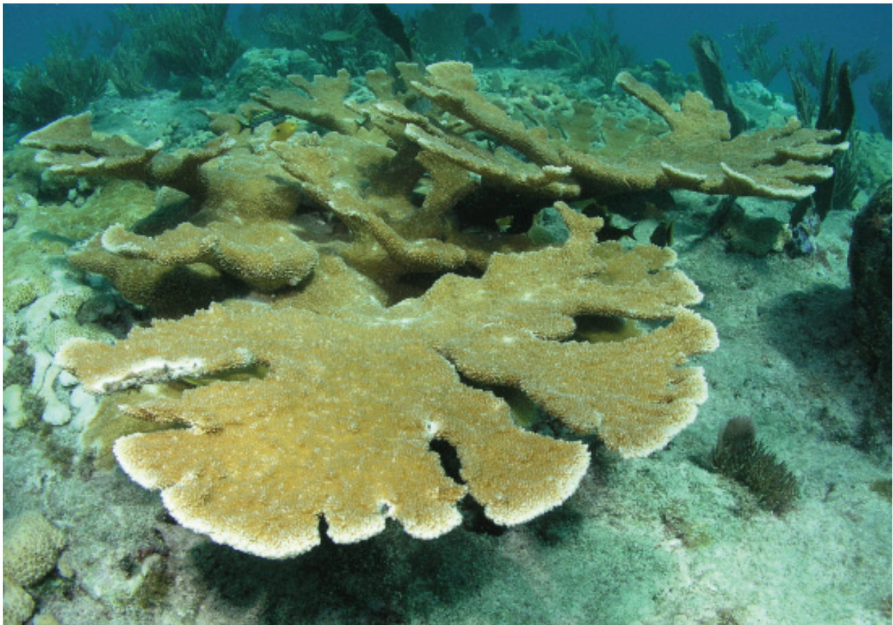
Elkhorn Coral, Photo Credit: Michael Barnette/NOAA

As the global ocean waters become warmer and more acidic, the likelihood increases for profound effects on marine and anadromous protected species and their habitats. In marine systems, climate change impacts extend beyond changes in temperature and precipitation to include changes in pH, ocean currents, loss of sea ice, and sea level rise among other factors. Climate smart conservation means enhancing resilience of protected species to climate-related changes using the best available science to make more informed management decisions. Efforts to understand the