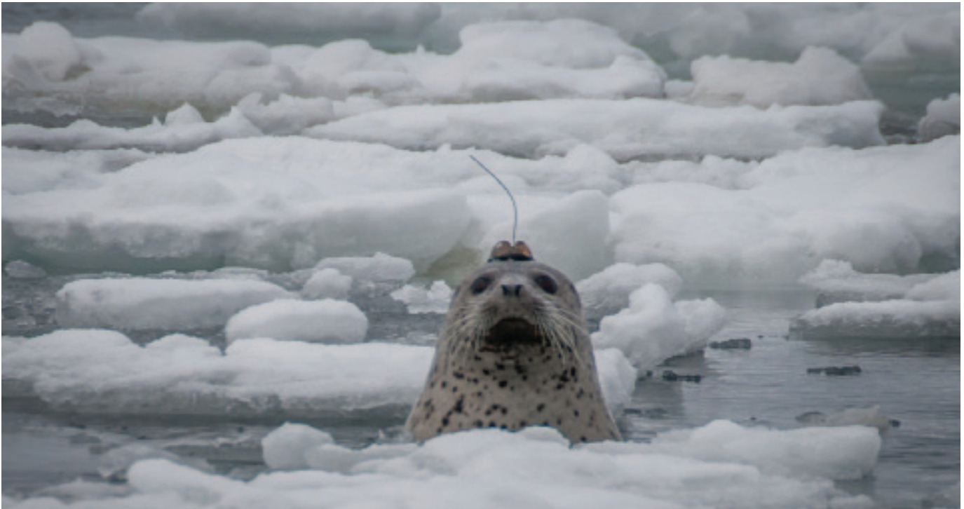
Spotted Seal, Photo Credit: D. Withrow/NOAA (NOAA Fisheries Permit 19309)

Tribal and State Agencies: We share management authority and responsibilities for listed species with states and tribes—most of our protected species live in state waters and rivers. We rely on state partners for assistance with research, status reviews, and recovery planning. Funding is available to states and tribes to implement high-priority recovery actions through the Species Recovery Grants program.