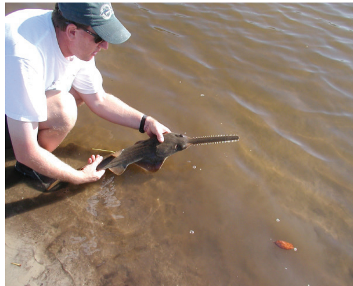
Smalltooth Sawfish

We will support NOAA offices, federal agencies, and state partners with the information they need to plan, make decisions, and accomplish their mission while preserving our natural legacy. By creating a culture of engagement and proactive conservation we support our partners' work, including assisting their development of the techniques and practices they need to support national protected species recovery and conservation goals. This support is particularly important to our partner federal agencies, which the ESA charges with conserving and recovering listed species as they implement their other statutory and regulatory responsibilities.