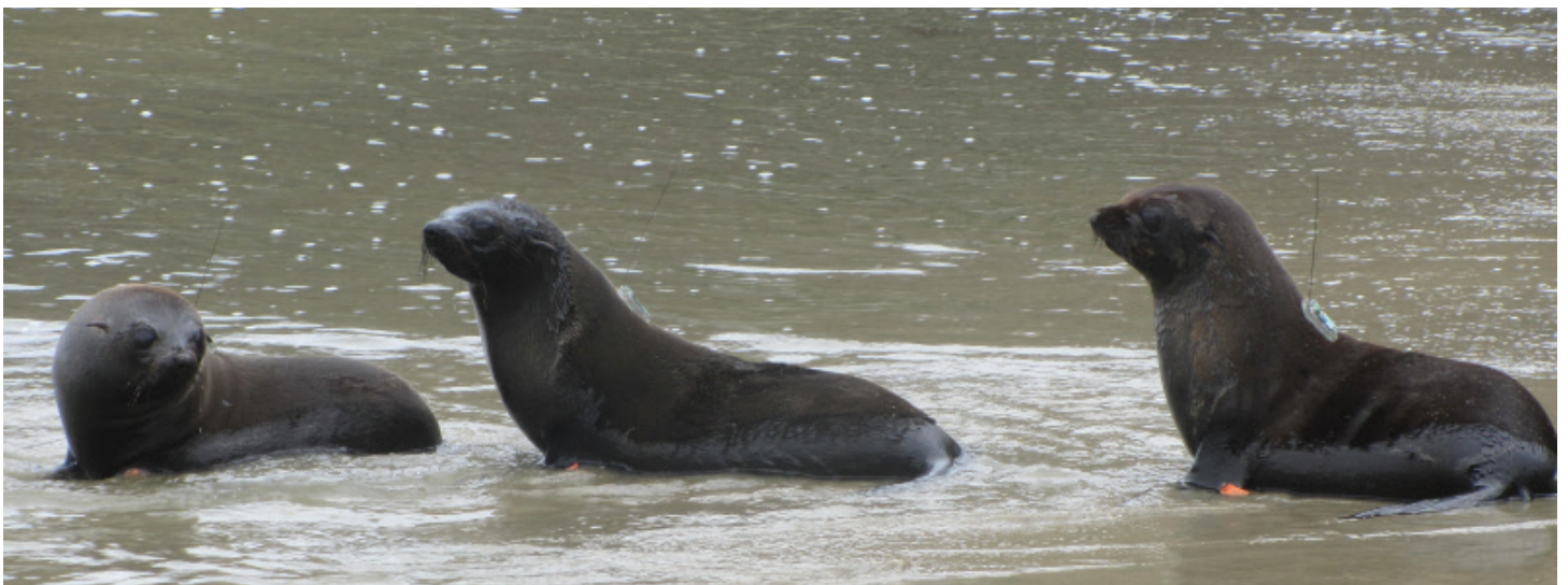
Guadalupe Fur Seal, Photo Credit: The Marine Mammal Center (NOAA Fisheries Permit 18786)