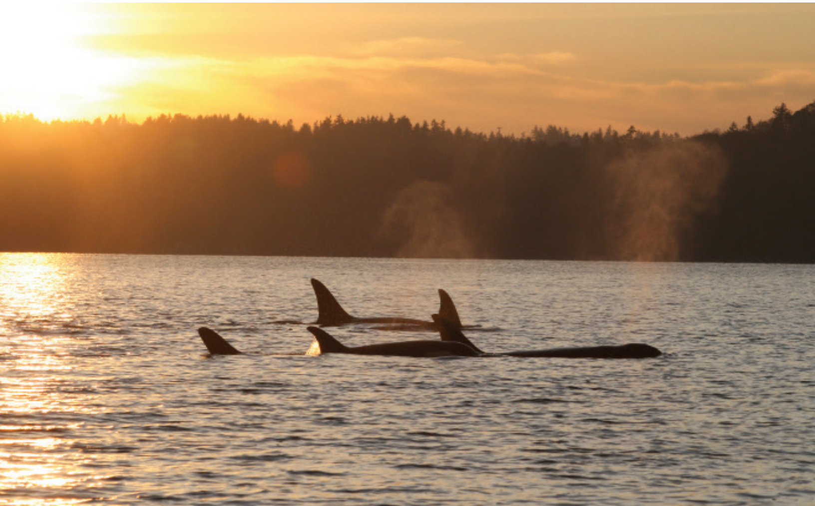
Southern Resident Killer Whale, Photo Credit: Candice Emmons/NOAA