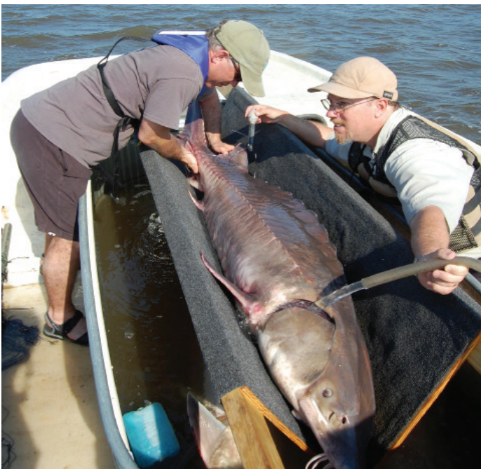
Atlantic Sturgeon

We also work collaboratively with other NOAA programs that have missions that overlap with protected resources conservation and recovery, such as the National Ocean Service's Office of National Marine Sanctuaries and the Coral Reef Conservation Program.