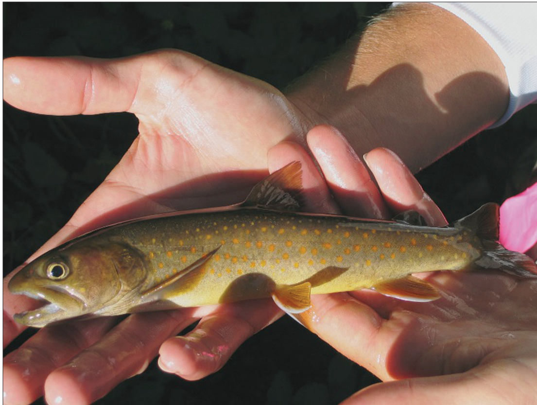
Resident bull trout at Dixon Creek.